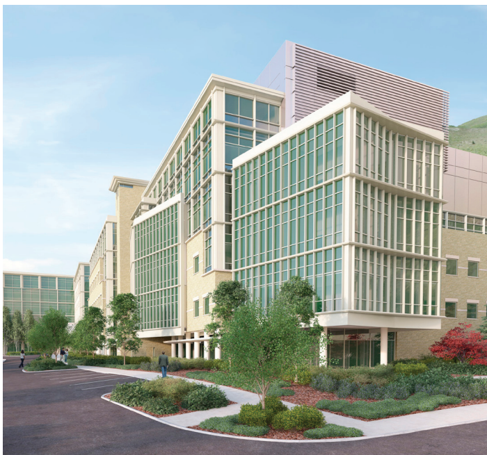
Huntsman Cancer Institute