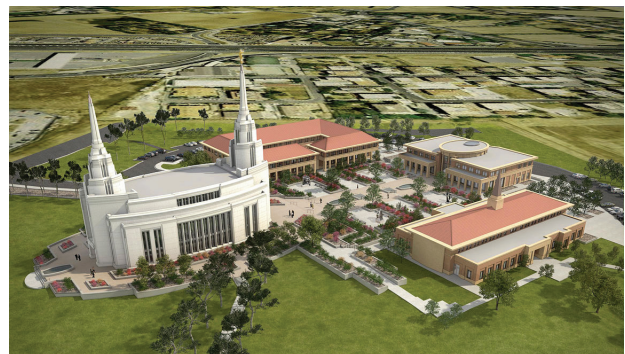
Rome, Italy Temple Complex